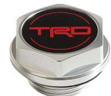
TRD Oil Cap $57 Parts Only MSRP**