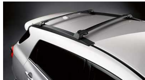
Roof Rack $350 Installed MSRP*