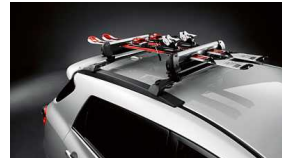
Ski/Snowboard Attachment with Mounts $194 Parts Only MSRP**