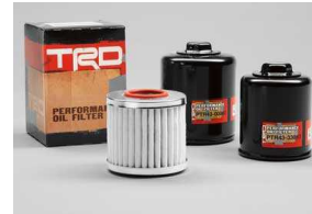
TRD Oil Filter $13 Parts Only MSRP**