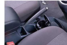
Ashtray Cup $26 Installed MSRP*