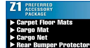
Preferred Accessory Package $330 Installed MSRP*