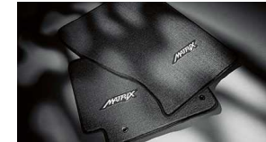
Carpet Floor Mats (5pc. set) $200 Installed MSRP*