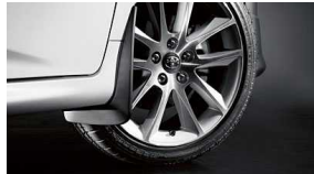
Mudguards Front (2pc set) $99 Installed MSRP*