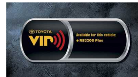
VIP RS3200Plus Security System $359 Installed MSRP*