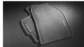
Carpet Floor Mats & Cargo Mat $200 Installed MSRP*