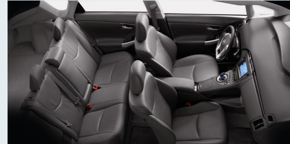
Prius interior shown in Dark Gray leather with available Advance Technology Package [28]