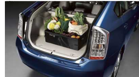
Cargo tote by Nifty Products $40 Installed MSRP*