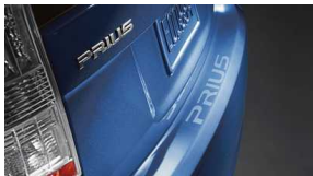
Rear bumper applique $69 Installed MSRP*