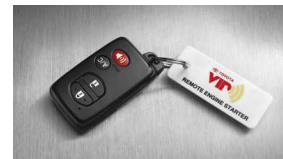
Remote engine start $529 Installed MSRP*