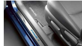
Illuminated door sill $359 Installed MSRP*