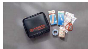
First aid kit $29 Installed MSRP*