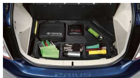
Cargo Organizer $49 Installed MSRP*