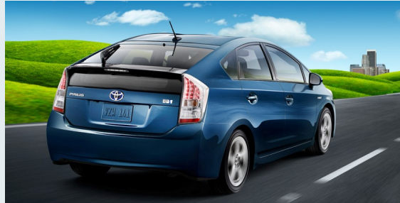
Prius V shown in Blue Ribbon Metallic with available Advanced Technology Package [28]