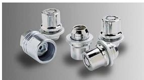
Wheel locks (alloy) $67 Installed MSRP*