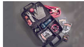
Emergency assistance kit $70 Installed MSRP*