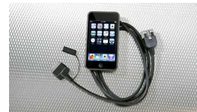
iPod Interface $299 Installed MSRP*